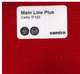
Rot Celtic IF120

67% wool, 20% Flame Retardant Viscose, 13% Viscose :: 75,000 Martindale :: EN 1021-1 & -2 :: BS 5852 :: BS 7176 Low & Medium Hazard