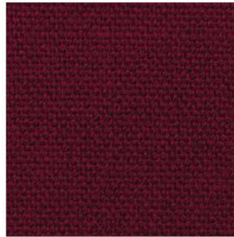
RED - IF101 VELA no.: 685