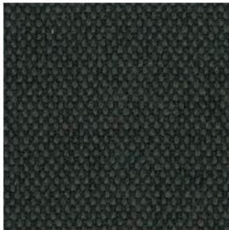
DARK GREY - IF276 VELA no.: 687