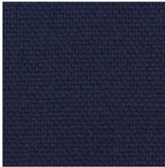
ROYAL BLUE - IF020 VELA no.: 686