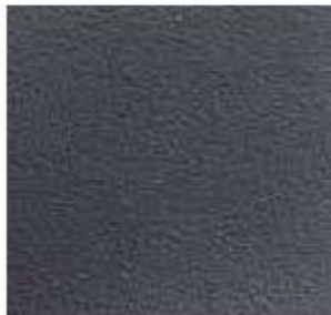
BLACK - 052

Top coat: 88,7% PVC :: Backing 11,3% polyester :: 50.000 cycles DIN53359 :: EN 1021-1 :: EN 1021-2