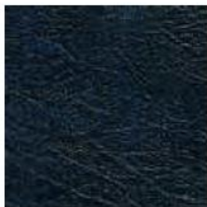
TINTO BLUE - 023

Top coat: 100% PVC :: Backing 100% cotton :: 300.000 cycles Martindale :: EN 1021-1 :: EN 1021-2